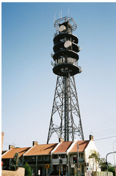
Figure 12.3.1 - An example of the negative visual impact of a tower on neighbouring houses.