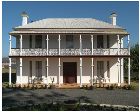
Figure 12.6.1 - An example of a heritage listed building.

Note: A Heritage Impact Statement must be prepared by a suitably qualified person in accordance with the document “Statements of Heritage Impact” published by the NSW Heritage Branch and available for view at: www.environment.nsw.gov.au