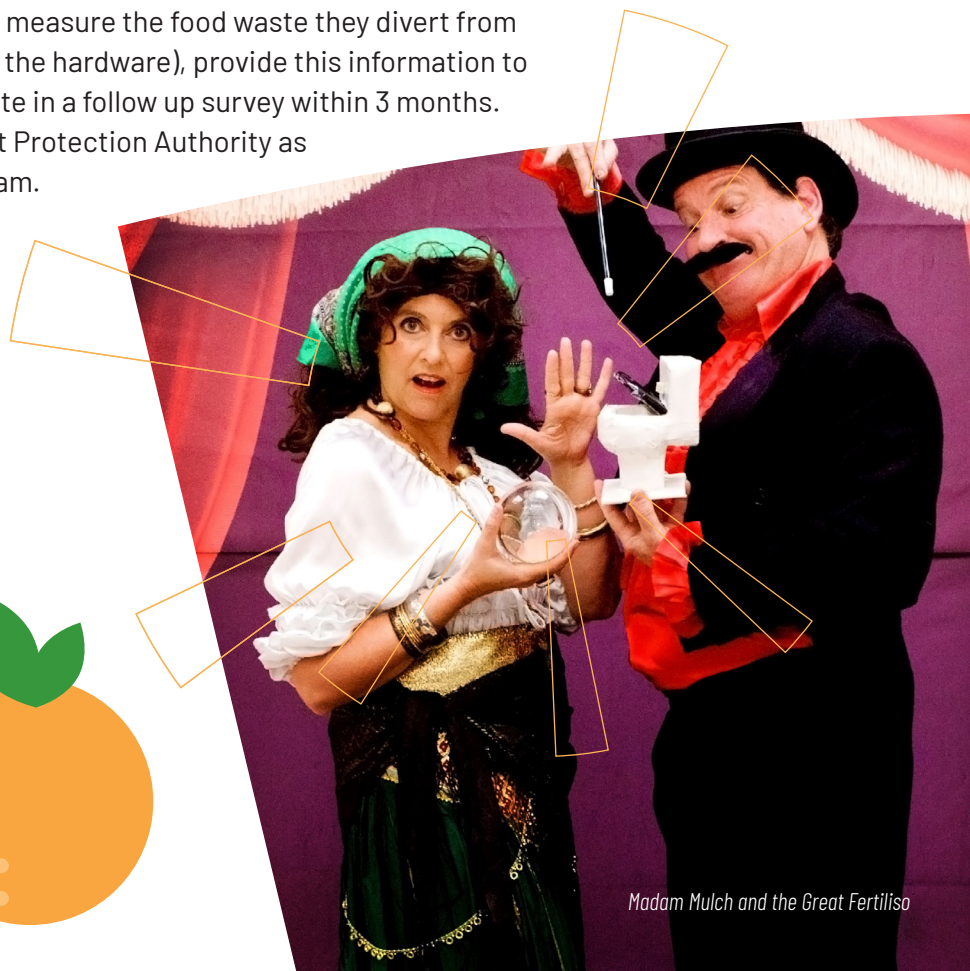
Madam Mulch and the Great Fertiliso