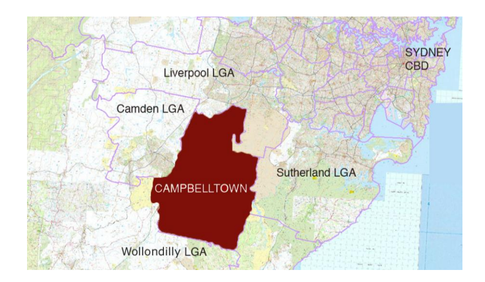
Figure 1.1 Study Area - Sub-regional context.