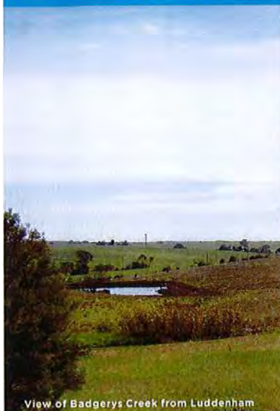
View of Badgerys Creek from Luddenham