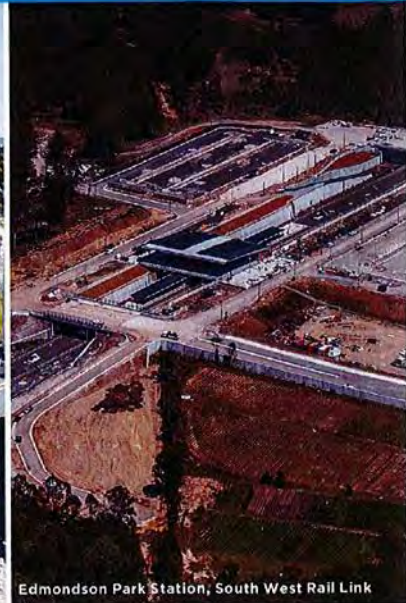
Edmondson Park Station, South West Rail Link