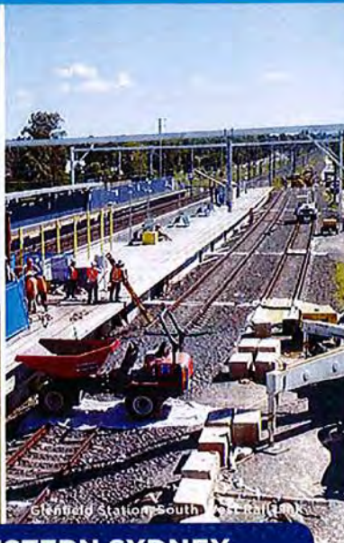
Glenfield Station South