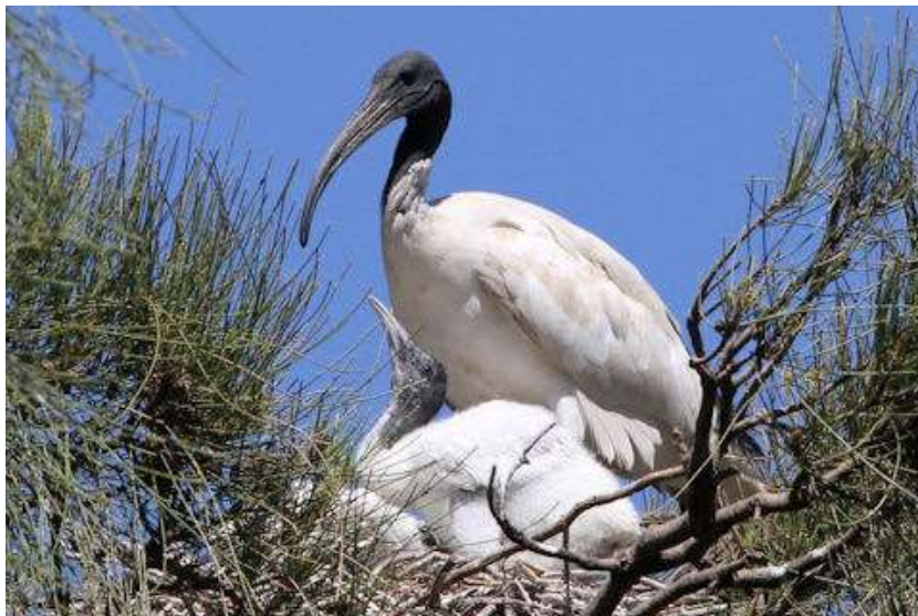
Figure 1. Adult AWI and juvenile in nest

The AWI traditionally diet on both terrestrial and aquatic invertebrates, however they are increasingly feeding on human food waste. Many AWI populations have learnt to exploit human food waste in urban environments. As a result AWI are becoming more common in urban areas and less common in their natural habitat.