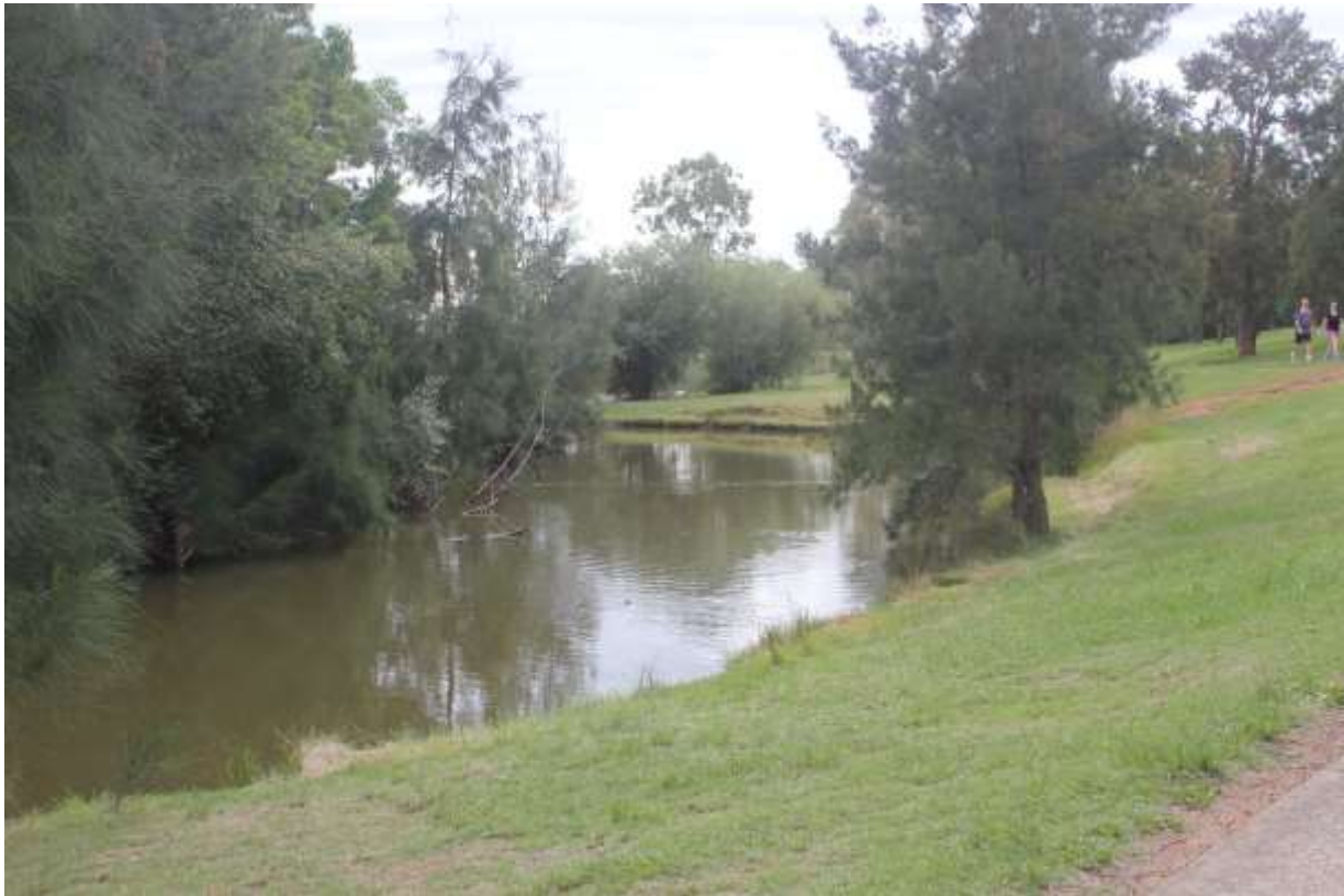
Figure 6: Southern side of refuge island at Eagle Vale Pond.