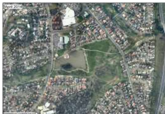
Figure 5. Eagle Vale Pond, Eagle Vale pictured as a stormwater detention basin in 2014