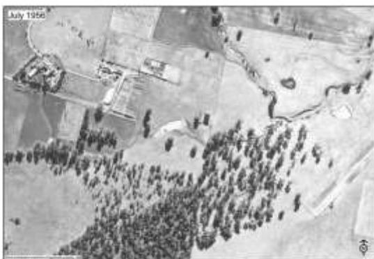
Figure 4. Eagle Vale Pond, Eagle Vale pictured as a farm dam in 1956

The waterbody now known as Eagle Vale Pond, Eagle Vale was constructed in or around the 1950's to serve as a farm dam to service the property. In the early 1980's the lake was utilised to ameliorate impacts from construction of the surrounding suburb, to trap sediment and assist in protecting water quality of the creek and downstream river. The refuge island was installed at this time to provide a refuge for fauna and to add additional lake edge for macrophyte plants to assist in preventing erosion and to aid water purification.