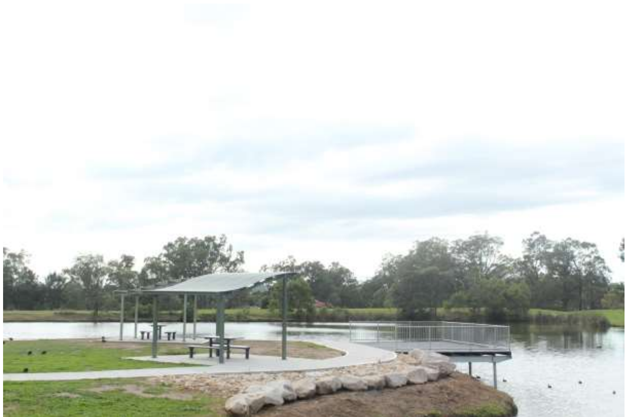
Figure 7: Path, tables and viewing platform at Eagle Vale Pond, Eagle Vale.

Recreational use of the reserve is limited to the viewing platform opposite the island and the perimeter of the lake for passive activities including walking, jogging, picnicking, and bird watching. There is a concrete path around the southern and eastern perimeter of the lake and due to the relative inaccessibility of the refuge island from the mainland there is no recreation activity on the island. The area is predominately used by local residents within walking distance. A visual aspect of the lake and associated recreational infrastructure is provided in Figure 7.