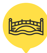
Build a bridge over the railway