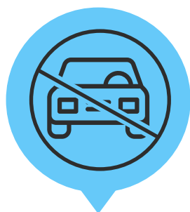
A car-free city