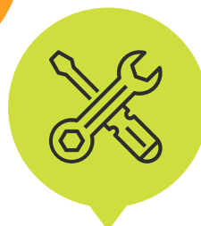
A Silicon Valley Hub