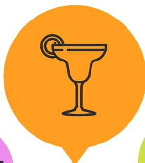
A Fortitude Valley Zone