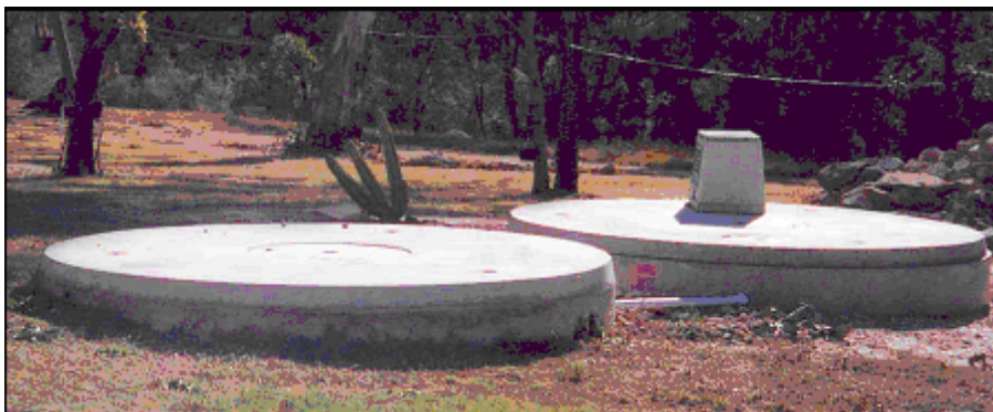
Photo 2: The irrigation chamber (the inspection hole located closest to the blower)

Photo 1: A typical twin tank AWTS system. The box like structure on top of the secondary tank is the blower, which provides aeration. The tank in the foreground is the primary settling tank.