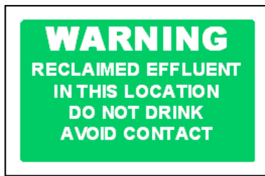
Figure 1 – Aerated Wastewater Treatment System and or A Private Recycled Water Scheme Warning Sign

The reclaimed effluent warning sign is to advise any visitors/guests who may not be familiar with wastewater management systems of the approved effluent application area and that the liquid being discharged should not be consumed and contact should be avoided.