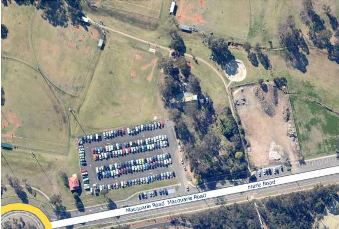
Milton Park Skate Bowl