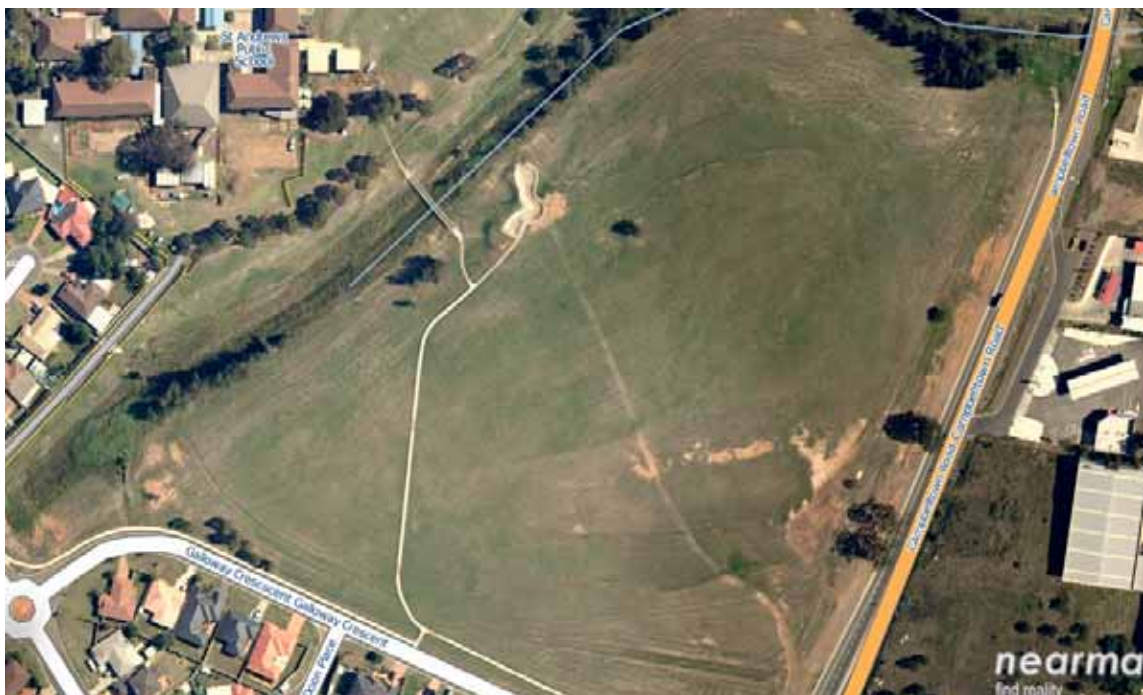
St Andrews Skate Bowl