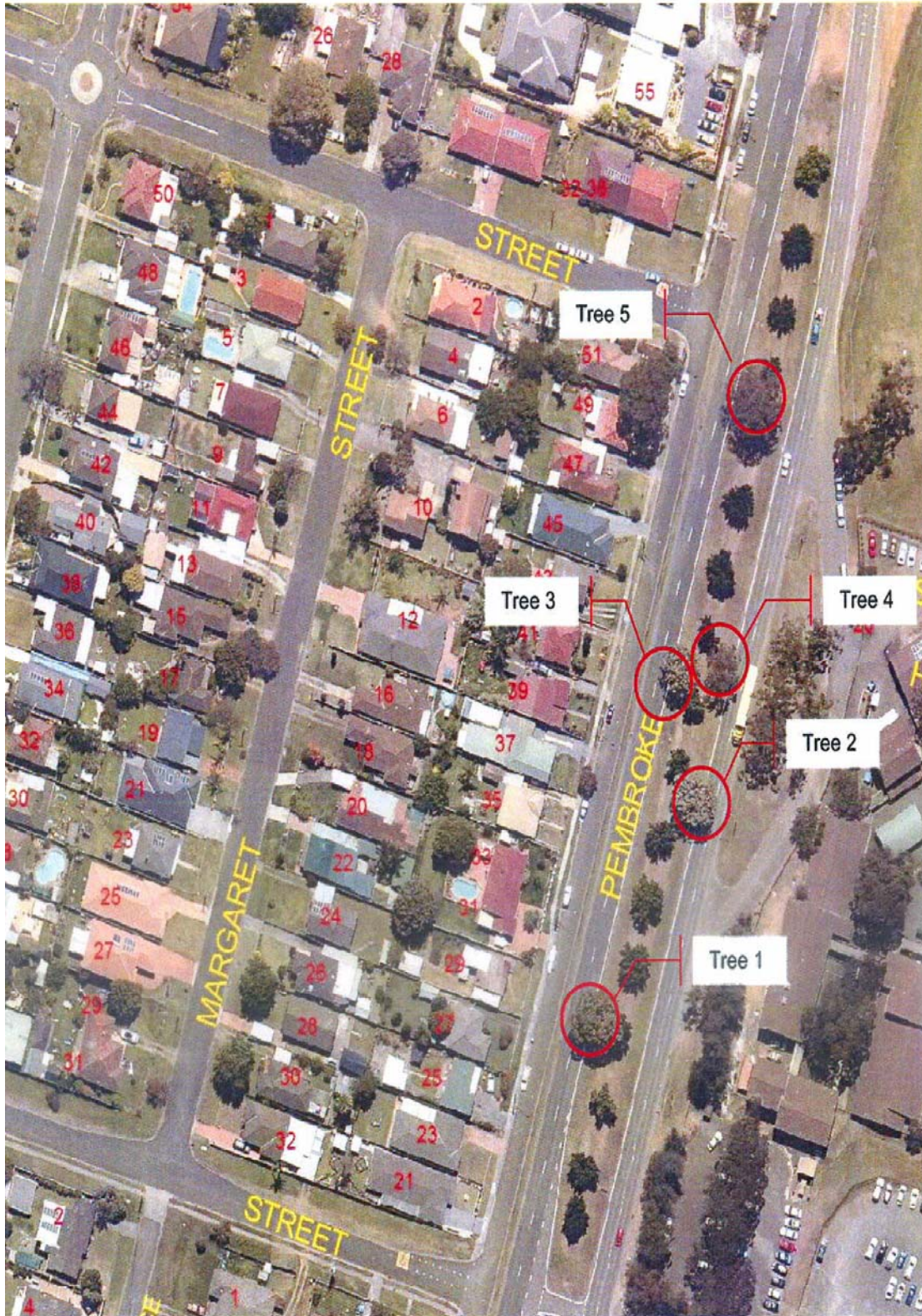
Locality Plan – Pembroke Road Median, Minto