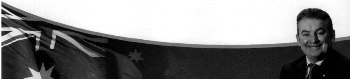
Russell Matheson MP Federal Member for Macarthur 14 December 2011

A handwritten signature in black ink, appearing to read 'R Matheson'.